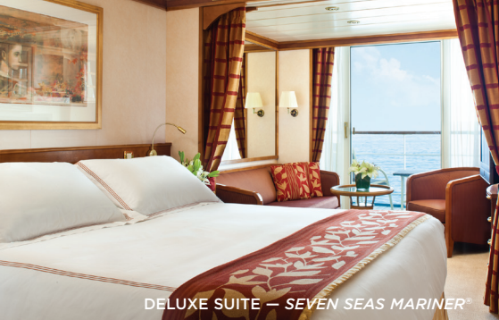
DELUXE SUITE — SEVEN SEAS MARINER®