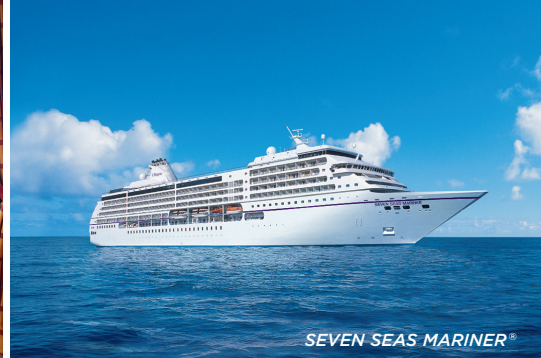
SEVEN SEAS MARINER®